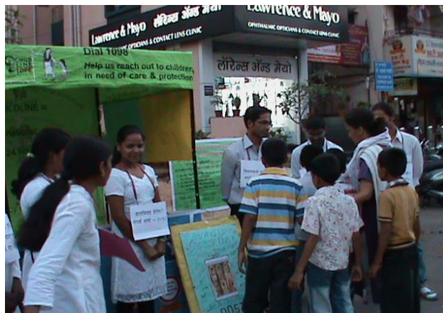
'Childline se Dosti Week '(Childline Nodal)