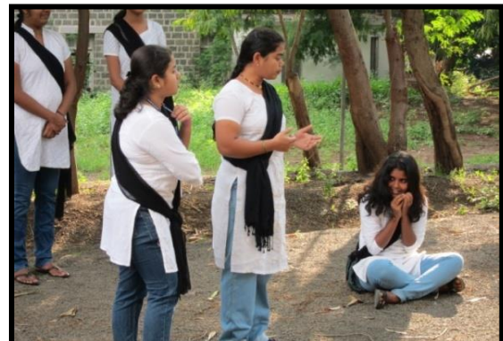
'Street Play -Mental Health Day'