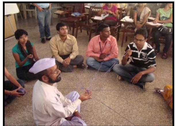
'Micro Planning Traing By YASHADA'