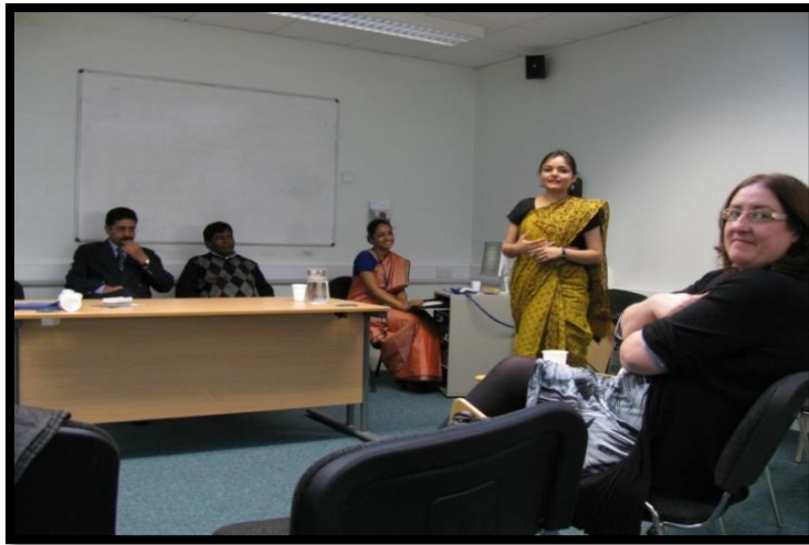
'Presentation by Student at Queen's University Belfast, U.K.'

New Collaboration has been requested from Universitat Jaume I (Spain) for placement of Master Degree in Copration and policies for development is in the process and will start from Aug. 2012.